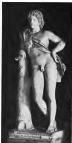
Fig. 54. Faun of Praxiteles.